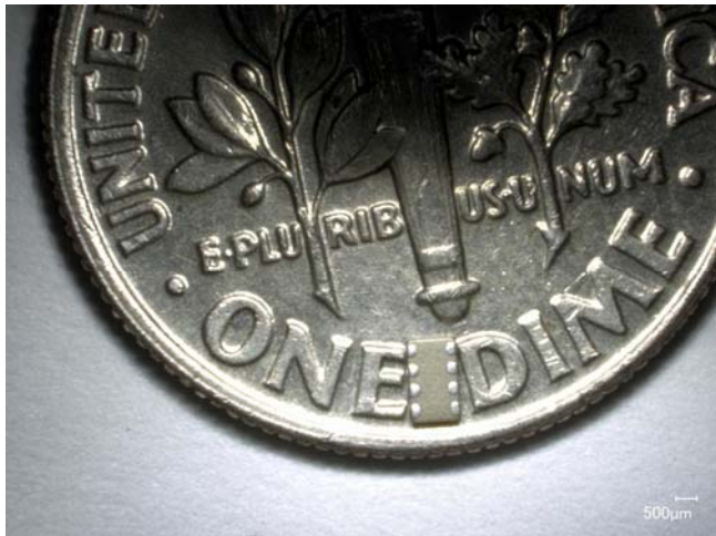
Figure 2. Photographic image of a typical IDC placed on a dime between the E and the D in “ONE DIME.” (The image was generated by JPL Analysis and Test Laboratory.)

For more information, contact Penelope Spence 818-354-2246