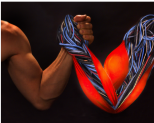
Figure 2: The grand challenge for the EAP actuated robotic arms.

In a future conference, once advances in developing such arms reach sufficiently high level, a professional wrestler will be invited for the next human/machine wrestling match.