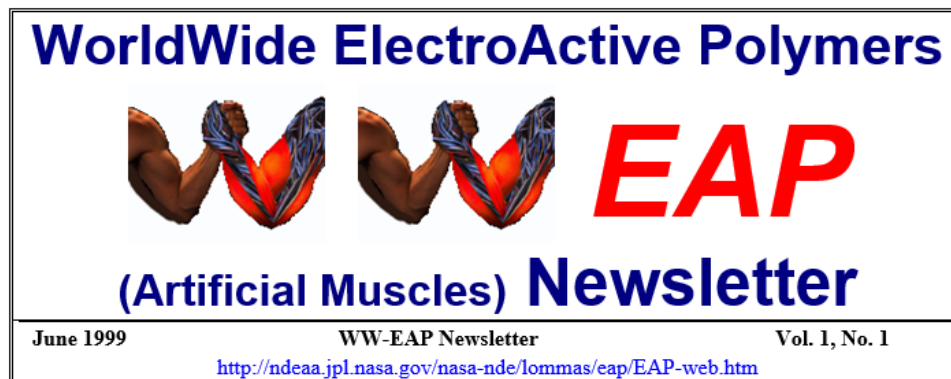
Figure 1: A snapshot from the first issue of the WW-EAP Newsletter.

As forums of information exchange, the author initiated in 1999 a website called the WorldWide EAP (WW-EAP) Webhub that archives related information and links to homepages of EAP research and development facilities worldwide [ http://eap.jpl.nasa.gov ]. In addition, since June 1999 the author has been publishing the semi-annual WW-EAP Newsletter that includes short synopses from authors worldwide providing snapshot of the advances in the field and related biomimetic applications ( Figure 1 ). This Newsletter is published electronically and its archived issues are accessible via the above mentioned WW-EAP webhub [ https://ndcaa.jpl.nasa.gov/nasa-nde/lommas/eap/WW-EAP-Newsletter.html ]. In December 2019, the 42 nd issue of the Newsletter has been published.