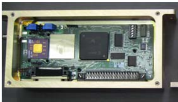
Figure 2. Digital Receiver (one of sixteen)

receiver array. Each of the 16 receivers maintains a downconverter from Ka-band to L-band (1.25 GHz) followed by a bandpass-sampling digital receiver. The choice of input frequency for the digital receiver was driven by the performance of currently available analog-to-digital converters (ADCs) as well as the desire to use the receivers for L-band radar applications in follow-on tasks. A single digital receiver is shown in Fig. 2.