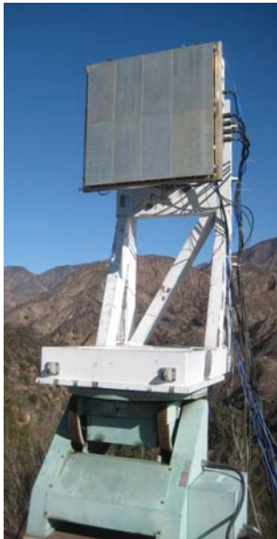
Figure 1. 1m x 1m Array on JPL Mesa Range

The key element for digital beamforming is the