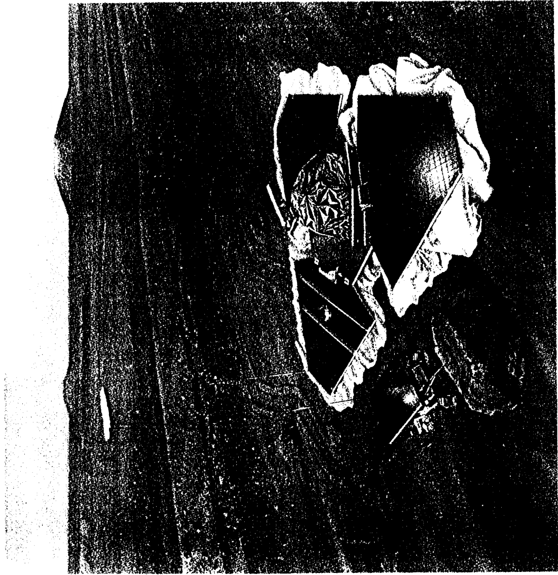
Figure 2. MESUR Pathfinder Landed Configuration with Microover Deployed