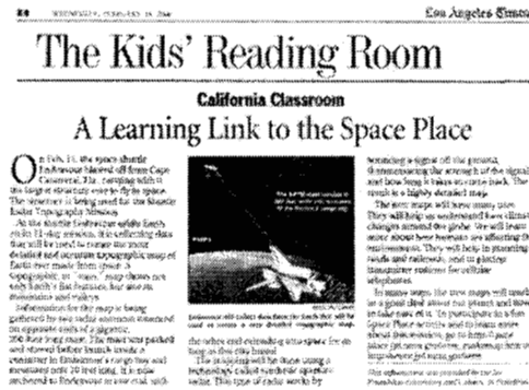
L.A. Times California Classroom "Learning Link to The Space Place" article on SRTM published February 16, 2000.