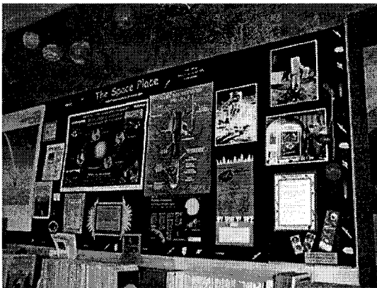
Exemplary Space Place Display at Daniel Boone Regional Library in Columbia, Missouri.

The primary criterion for becoming a Space Place partner is to be situated in a small community. The intention is to offer the partnerships to communities that otherwise have little or no direct contact with the space program. Also, partners are scattered geographically to maximize the reach. Space Place partners are generally at least 150 miles apart.