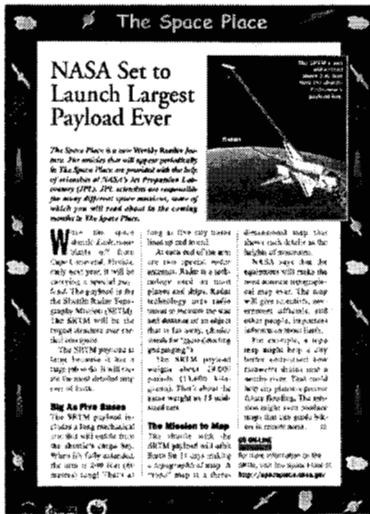
Weekly Reader 4 Space Place article on SRTM ( Shuttle Radar Topography Mission ), published November 5, 1999.